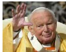
John Paul the Great.

Throughout his 27-year papacy, Pope John Paul II worked closely with the Knights of Columbus. From restoring the facade of St. Peter's Basilica to supporting the construction and operation of the John Paul II Cultural Center in Washington, D.C., the Order strongly supported the work of